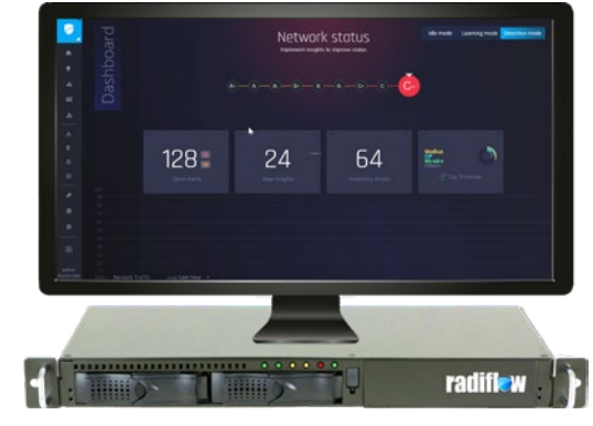
The iSAP Smart Collector is used in conjunction with Radiflow's iSID Industrial Threat Detection System

iSAP helps reduce costs by requiring only one iSAP device for each remote network site. Each iSAP securely connects to a centrally located iSID Threat Detection server, where corporate-wide network and device activity is analyzed.